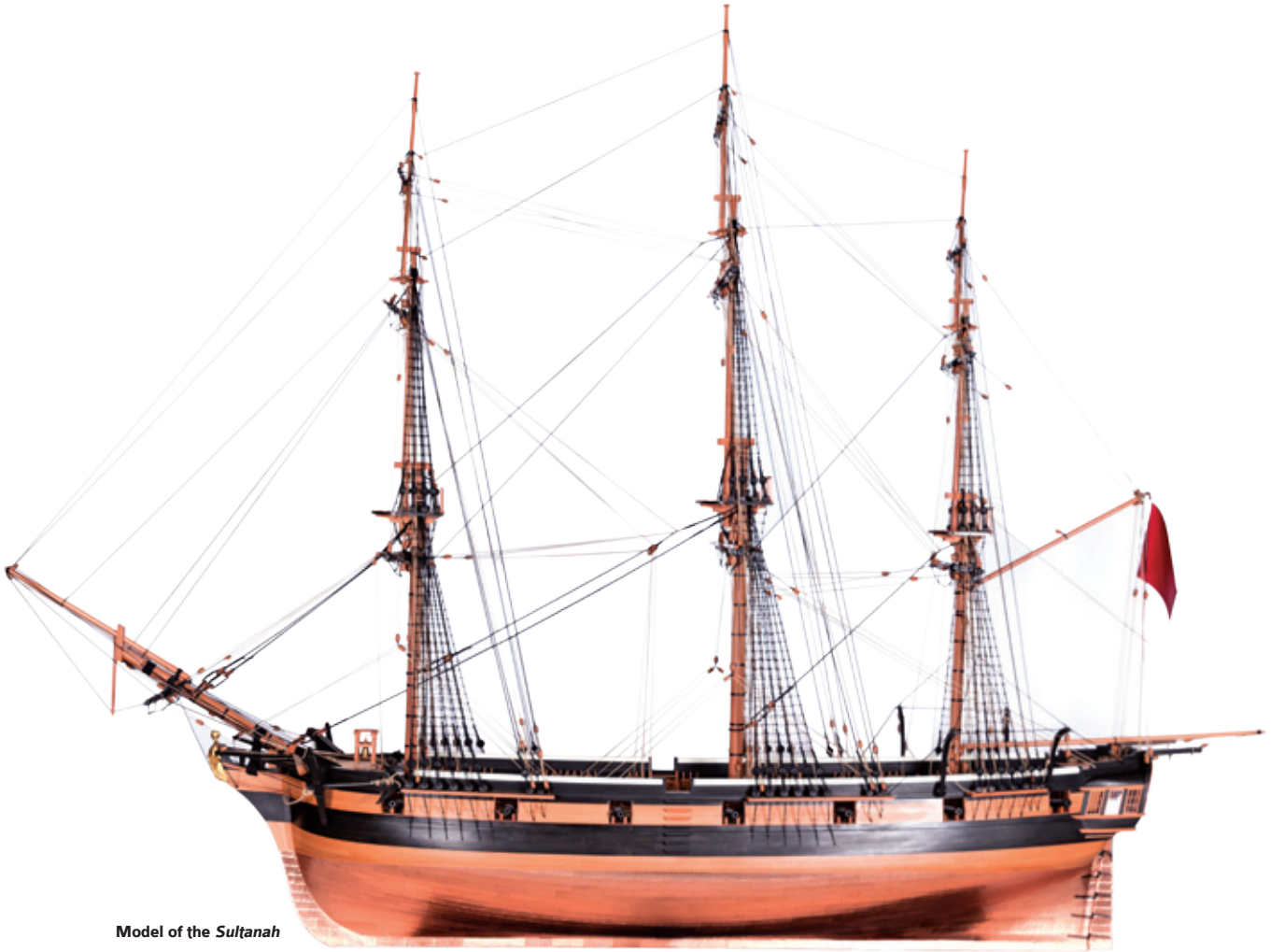
Model of the Sultanah